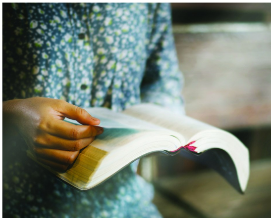
Excerpts from the Lectionary for Mass ©2001, 1998, 1970 CCD. The English translation of Psalm Responses from Lectionary for Mass © 1969, 1981, 1997, International Commission on English in the Liturgy Corporation. All rights reserved.

Hb 1:2-3; 2:2-4/Ps 95:1-2, 6-7, 8-9 (8)/ 2 Tm 1:6-8, 13-14/Lk 17:5-10