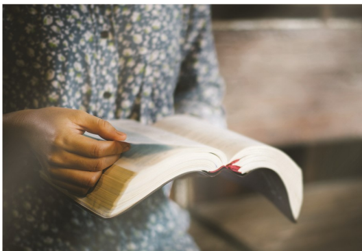
Excerpts from the Lectionary for Mass ©2001, 1998, 1970 CCD. The English translation of Psalm Responses from Lectionary for Mass © 1969, 1981, 1997, International Commission on English in the Liturgy Corporation. All rights reserved.