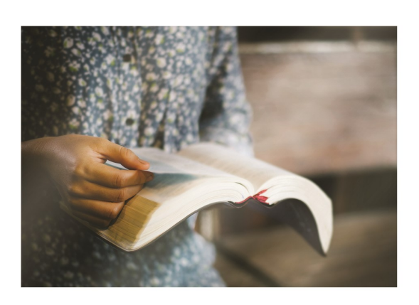
Excerpts from the Lectionary for Mass ©2001, 1998, 1970 CCD. The English translation of Psalm Responses from Lectionary for Mass © 1969, 1981, 1997, International Commission on English in the Liturgy Corporation. All rights reserved.